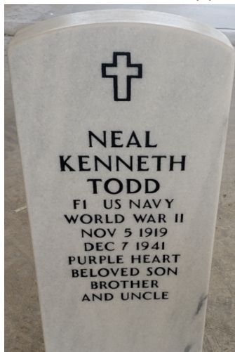
UPRIGHT HEADSTONE WHITE MARBLE (U) OR LIGHT GRAY GRANITE (V)

This headstone is 42 inches long, 13 inches wide and 4 inches thick. Weight is approximately 230 pounds. Variations may occur in stone color, and the marble may contain light to moderate veining. Additional inscription is limited to 15 characters (including spaces) up to four lines maximum.